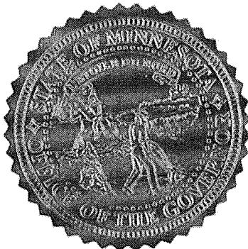
Tim Walz Governor