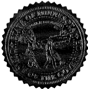
Tim Walz Governor